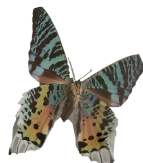
Madagascan Sunset Moth

For more information on Porter House Museum or our other educational opportunities visit PorterHouseMuseum.org or like us on Facebook.