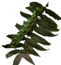
Regal Moth Caterpillar